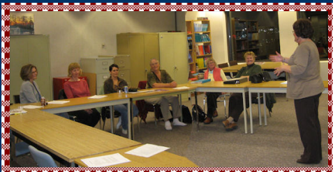
Tutor Training – Sept 25th

“Studies show that higher literacy levels result in higher health levels and better quality of life.”