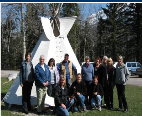
Regional Meeting May 2008